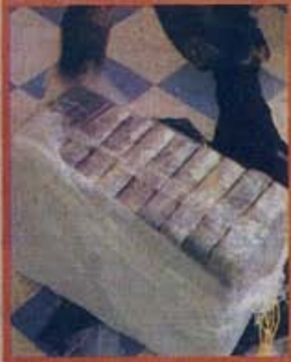
This cocaine has a street value of $1.5M